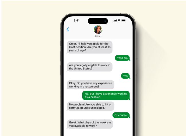
Shown here: a conversational application utilizing SMS chat to apply.